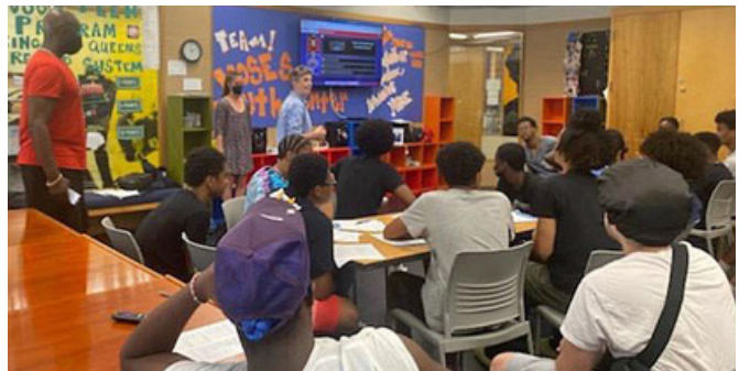
JJJ can be played in both classrooms and community centers.